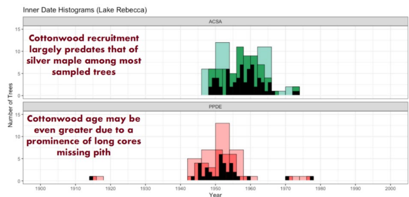
Figure 3. Year of silver maple (top) and cottonwood (bottom) recruitment to a 4.5 foot tall height at Lake Rebecca in Pool 3.

The age structure of UMR floodplain forests is not well understood, and it is not clear for many tree species whether they require high intensity disturbance to regenerate or whether they persist in uneven-aged systems. By comparing actual age structure and annual growth rates for individual species, and relating those data to current forest composition and structure and to environmental variables, we will be able to characterize the ability of individual tree species to persist within aging forests. In addition, relationships between the year of tree establishment and environmental and forest conditions at the time of establishment will allow us to describe natural patterns of forest regeneration in the context of river dyanmics. Site-level age structure will be related back to environmental variables to assess whether there are discrete associations between known disturbance events and tree establishment. These insights will provide critical information for determining future trajectories of floodplain forests and whether the species currently present on the site are likely to persist. They will also help to define key periods in forest development at which management interventions may be necessary to ensure long-term forest health and reduce potential for invasive species establishment.