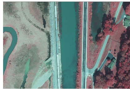
Figure 1. Phase One iXU-RS 1000 RGB and 1000 Achromatic digital cameras with co-registration base plate for generating four-band aerial imagery that can be displayed as natural color or color infrared.