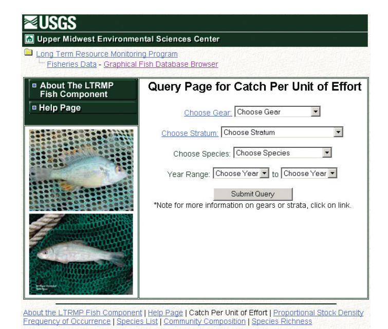
Figure 2. This is an example of a Search Page for one of the six metrics available through the Graphical Fish Database Browser (Figure 1). In this example with "Catch Per Unit of Effort," the user simply selects a gear type, a sampling stratum, a species, and a range of years in which they are interested.

es, and download a text file of the search results. These features are explained in more detail in a Help Page included with the browser (http://www.umesc.usgs.gov/data_library/fisheries/graphical/fish_database_help.html).