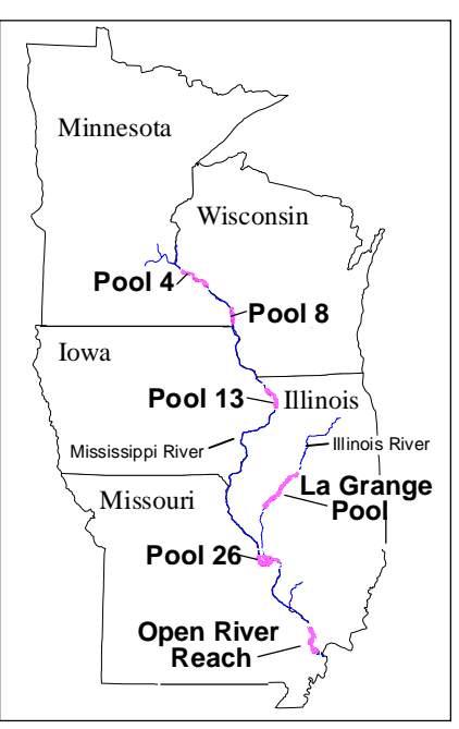
Figure 1. Long Term Resource Monitoring Program (LTRMP) study areas of the Upper Mississippi River System. Graphic by Todd M. Koel, Illinois Natural History Survey, Havana, Illinois.

The Spatial Query Tool (Figure 2) integrates the LTRMP component data with spatial data layers and allows the