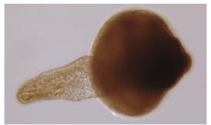
A juvenile winged mapleleaf mussel ( Quadrula fragosa ; foot extended) recovered after 266 days of development in a simulated St. Croix River thermal regime and <24 hours after excystment from its channel catfish host ( Ictalurus punctatus ).

A species-specific temperature threshold for early life development of poikilotherms can be empirically derived from repeated embryological observations made over an environmentally relevant temperature range. Given a complete