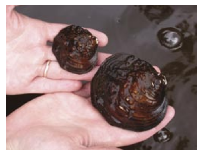
The only known reproducing population of winged mapleleaf mussels (Quadrula fragosa) inhabits the St. Croix National Scenic Riverway.

A series of WML host-fish identification trials were conducted with as many as four species of the catfish family (Ictaluridae) including blue catfish (Ictalurus furcatus; BCF), channel catfish (I. punctatus; CCF), flathead catfish (Pylodictus olivarus; FHC), and slender madtom (Noturus exilis; SMT). On four dates in autumn 2003, fish were infested with viable glochidia from several winged mapleleaf mussels from the St. Croix River.