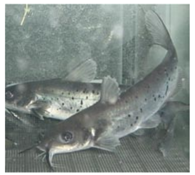
Fish were kept in laboratory aquaria during all tests to monitor the daily excystment of juvenile winged mapleleaf mussels (Quadrula fragosa).

Test III - one group of CCF was maintained 45 d at 12.5°C, then held in a thermal regime similar to the St. Croix River from November 2003 to June 2004.