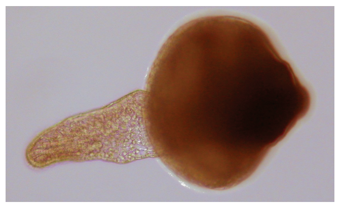
A juvenile winged mapleleaf mussel ( Quadrula fragosa ; foot extended) recovered after 266 days of development in a simulated St. Croix River thermal regime and <24 hours after excystment from its channel catfish host ( Ictalurus punctatus ).

A species-specific temperature threshold for early life development of poikilotherms can be empirically derived from repeated embryological observations made over an environmentally relevant temperature range. Given a complete