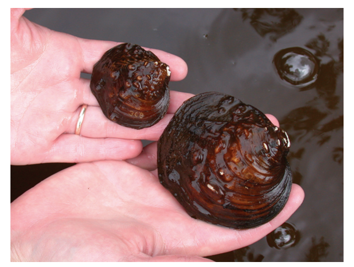
The only known reproducing population of winged mapleleaf mussels (Quadrula fragosa) inhabits the St. Croix National Scenic Riverway.

A series of WML host-fish identification trials were conducted with as many as four species of the catfish family (Ictaluridae) including blue catfish (Ictalurus furcatus; BCF), channel catfish (I. punctatus; CCF), flathead catfish (Pylodictus olivarus; FHC), and slender madtom (Noturus exilis; SMT). On four dates in autumn 2003, fish were infested with viable glochidia from several winged mapleleaf mussels from the St. Croix River.