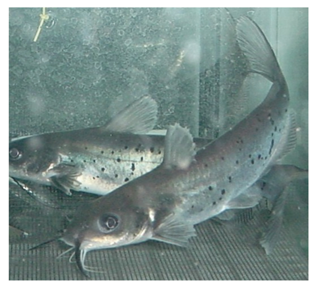
Fish were kept in laboratory aquaria during all tests to monitor the daily excystment of juvenile winged mapleleaf mussels (Quadrula fragosa).

Test III \dashv one group of CCF was maintained 45 d at 12.5°C, then held in a thermal regime similar to the St. Croix River from November 2003 to June 2004.